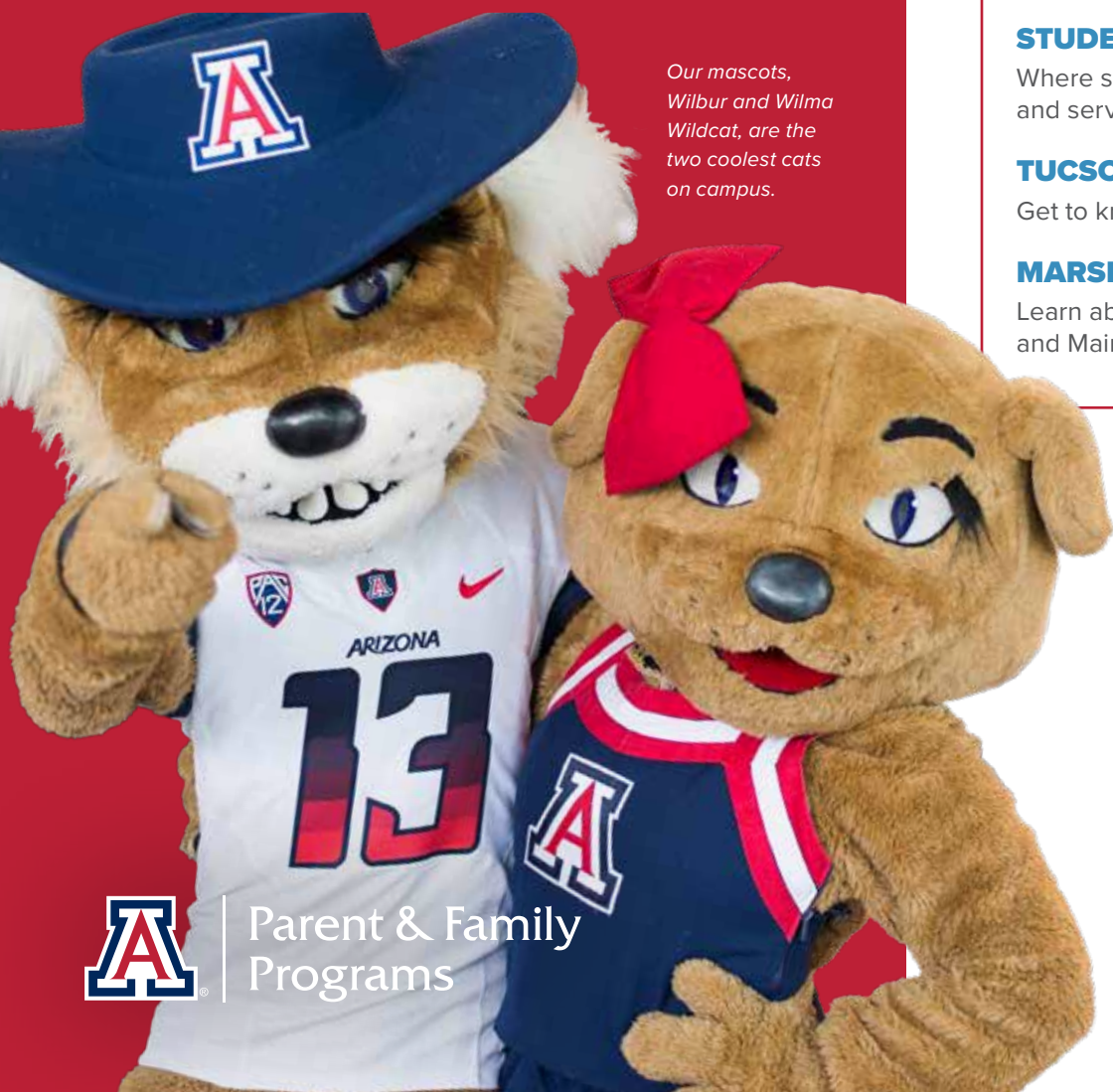
Our mascots, Wilbur and Wilma Wildcat, are the two coolest cats on campus.

Working together to expand human potential, explore new horizons, and enrich life for all.